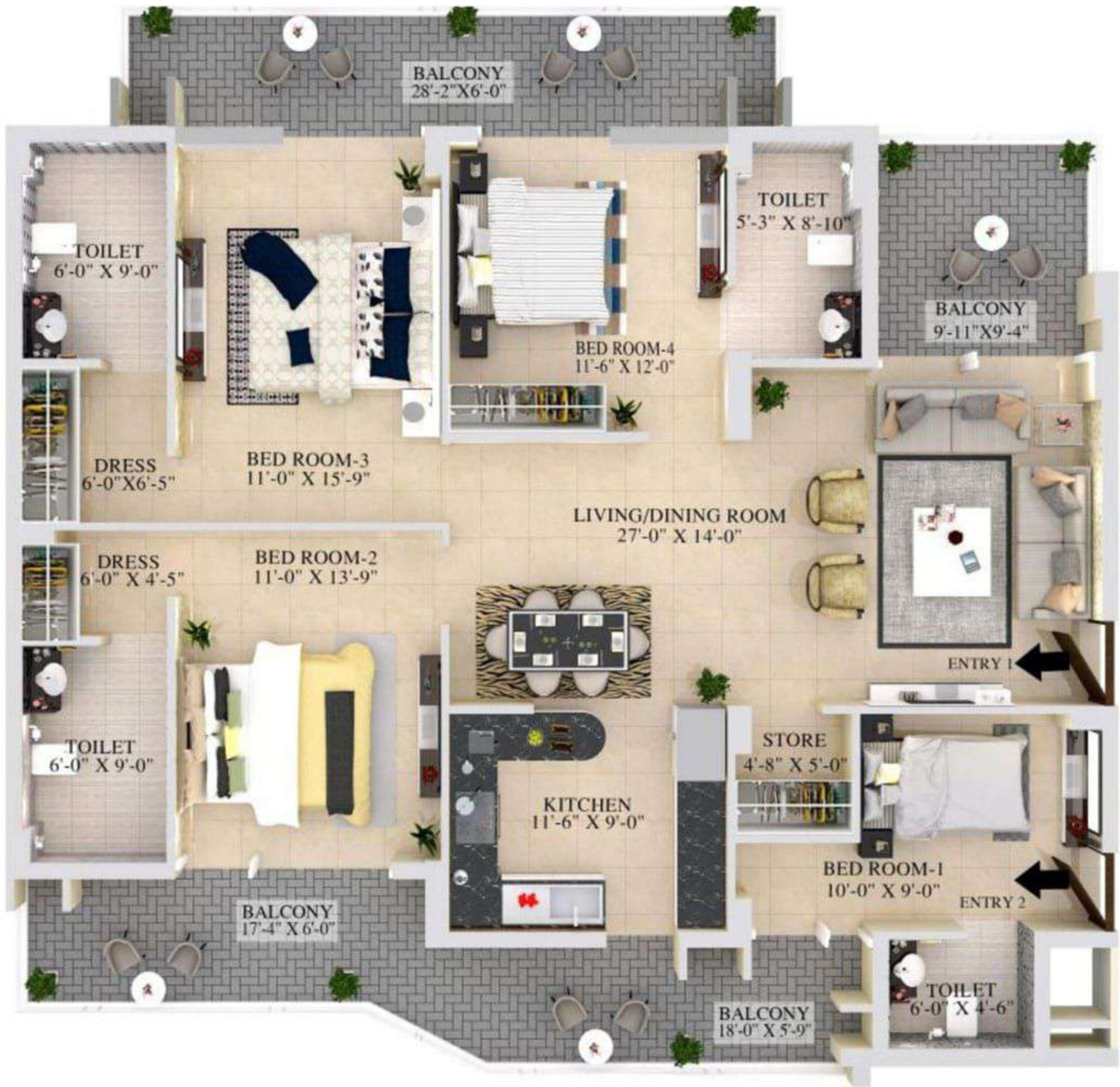
3 BHK + S - Tower : E, F, G Carpet Area - 1346 Sq.ft. | Unit Area - 1917 Sq.ft. Super Area - 2525 Sq.ft.