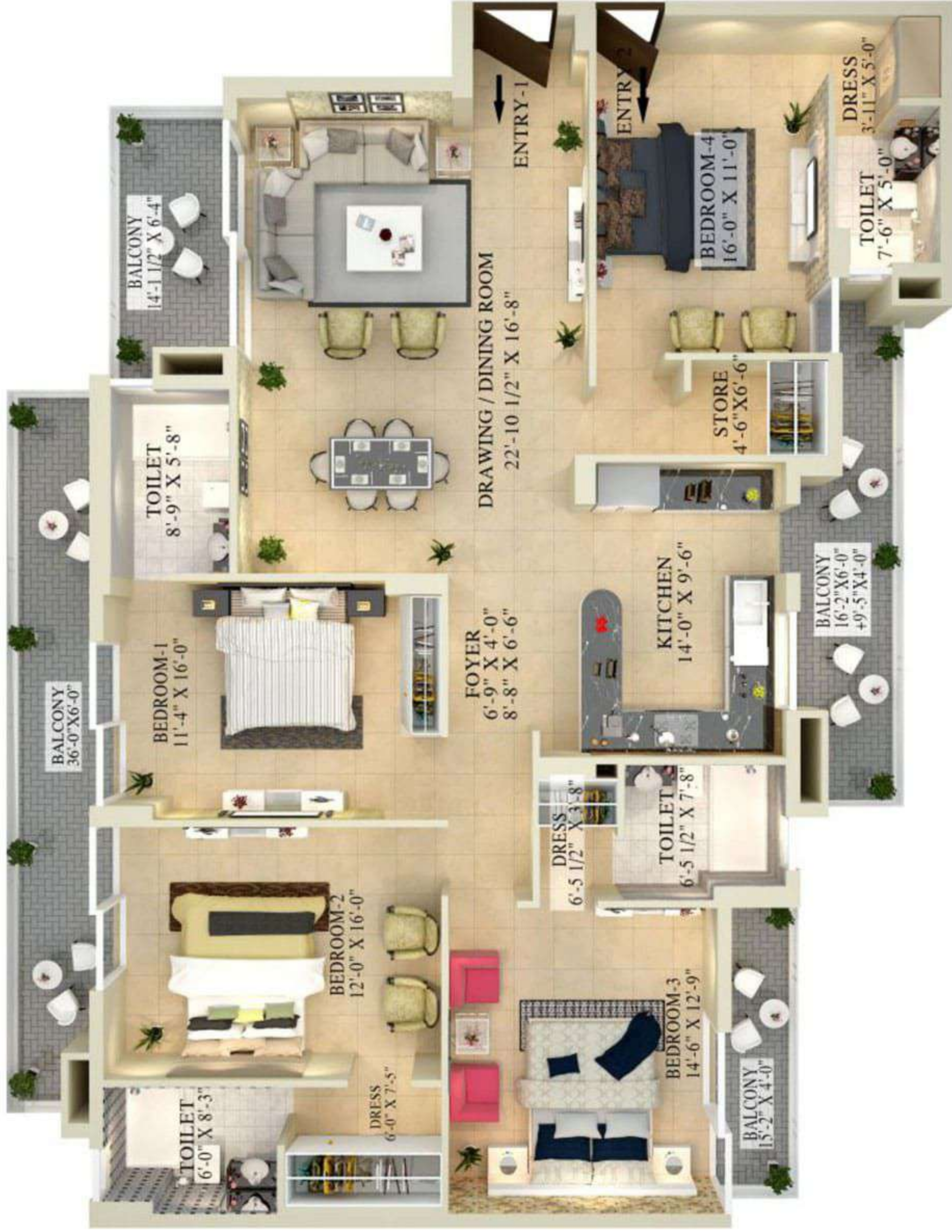
4 BHK - Tower : K, L, M Carpet Area - 1741 Sq.ft. | Unit Area - 2363 Sq.ft. Super Area - 3130 Sq.ft.