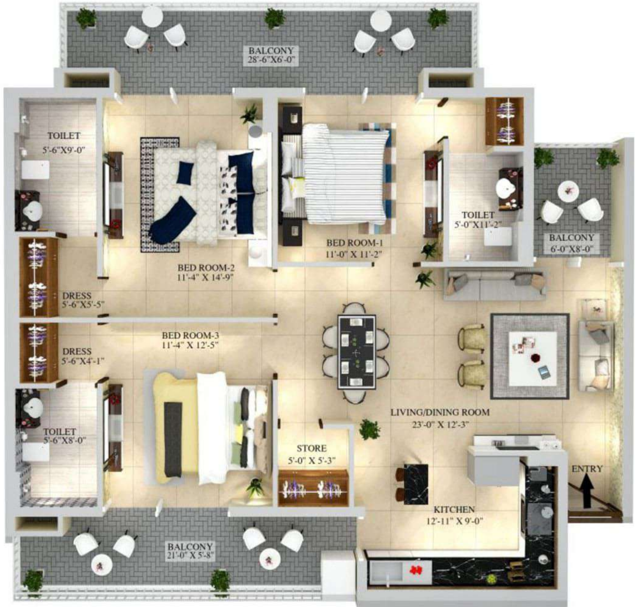
3 BHK - Tower : A, B, C, D, N, O, P, Q Carpet Area - 1110 Sq.ft. | Unit Area - 1549 Sq.ft. Super Area - 2100 Sq.ft.